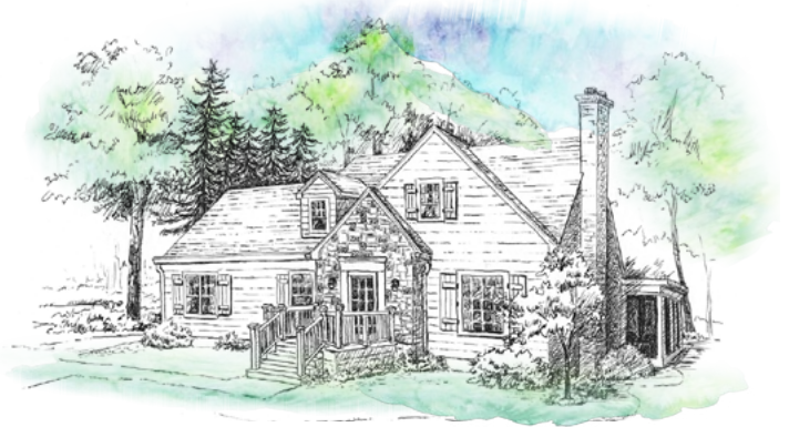
We can't wait to officially open our doors