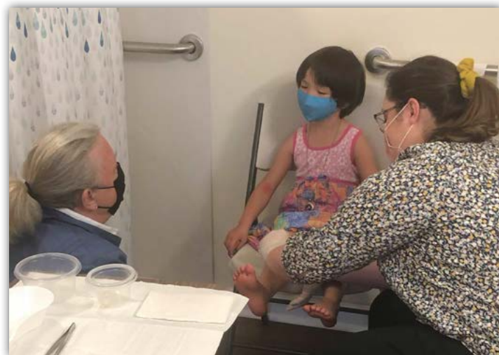
Learning from a little one

In 2021, training was offered remotely and at The Cottage. In addition to teaching, we have mentored in the field assisting Christian Scientists all over the country. Students have also participated in Christian Science nursing at two Christian Science camps and a Christian Science nursing facility.