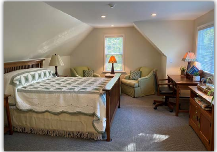
Rest and Study Accommodations