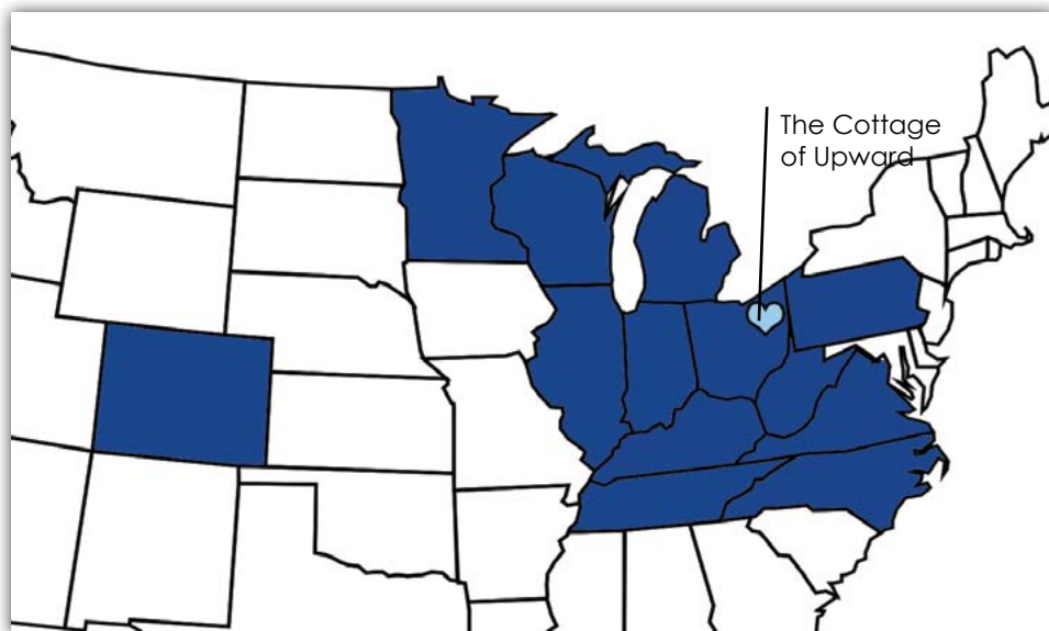
Geographical growth of Upward Wing's Service

and support anyone who calls looking for a Christian Science nurse - regardless of location. On occasion, our staff has traveled to provide Christian Science nursing care until other arrangements are found, but most often we work with the caller to find the right local solution to meet their need. This activity has been an especial joy for us. We have linked into an incredible network of Christian Science nurses who are dedicated to meeting an individual's need in their own home.